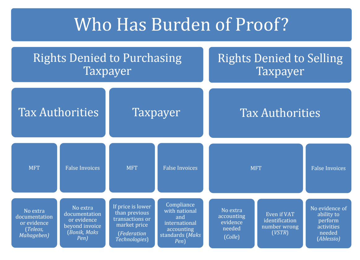
Diagram 5: CJEU Jurisprudence on Burden of Proof

the Court sought to confirm that, notwithstanding exceptional circumstances where the onus of the proof had been inverted, no additional obligations could be placed on the taxpayer, except for the provision of a standard invoice and compliance with international accountancy standards, and that the same rules applied for both types of organised VAT fraud. Yet, there is still evidence that some Member States are not applying even the guiding principle concerning the onus of proof, and placing the burden on taxpayers to prove that they did not know, and could not have known, that they were involved organised fraud.<sup>170</sup> This stance is in contrast with Member States' approach to burden of proof rules in the context of tax avoidance, where until recently they have been perceived as being broadly compliant with CJEU case-law.<sup>171</sup> Diagram 4 offers a summary of existing case-law on burden of proof in cases concerning organised VAT fraud.